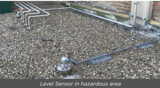
Level Sensor in hazardous area