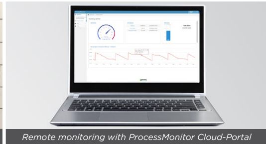
Remote monitoring with ProcessMonitor Cloud-Portal