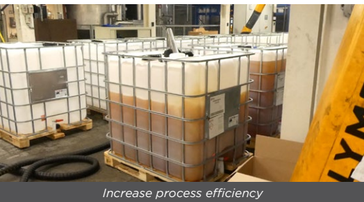
Increase process efficiency