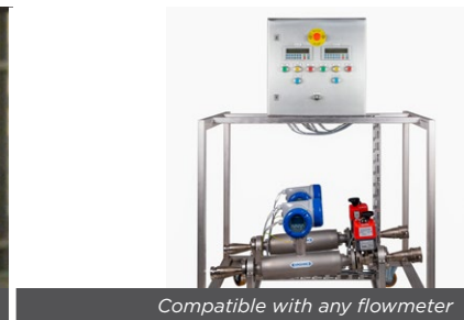
Compatible with any flowmeter