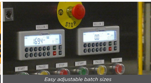
Easy adjustable batch sizes